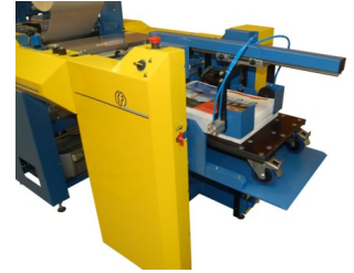
Optional Pallet Stacker