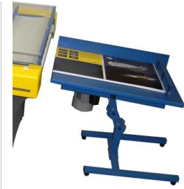
Optional Jogger 530

Pair of ionization bars that remove static charge from laminated paper.