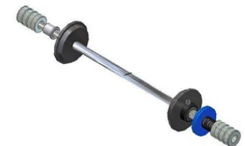
Optional Supply Roll Shaft